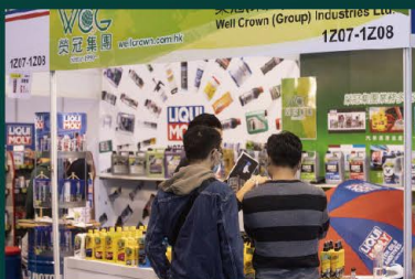
汽車改裝美容服務區 Automotive Conversion & Beauty Services Zone