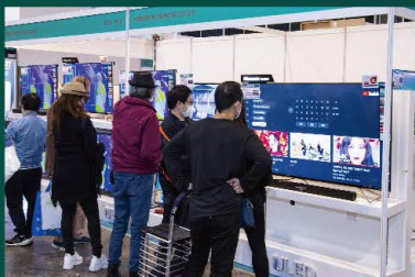
數碼電子產品區 e-Digital Products Zone