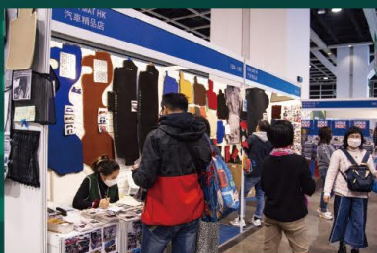
汽車產品及配件區 Automotive Products & Accessories Zone