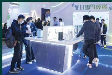
電子娛樂及電訊科技區 e-Entertainment & Telecommunication Zone