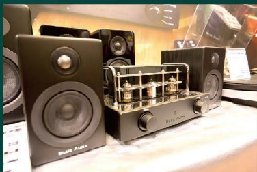
攝影器材及音響區 Photographic & AV Equipment Zone