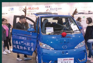
電動及汽車展示區 Electric Vehicle & Automobile Display Zone